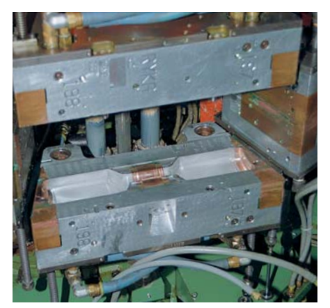
Cargocaire dehumidifiers blanket mold cavities with dry air. This prevents the "mold sweat" which can reduce machine capacity.

According to Glenn Holifield, the Cargocaire dehumidifiers are simple and reliable, requiring very little maintenance apart from changing filters and semiannual lubrication. In short, the benefits are substantial and they are achieved at minimal cost.